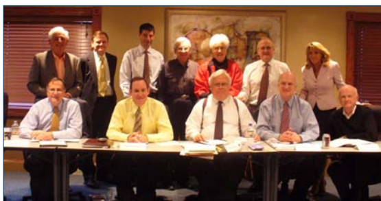
WCAN Board hosts March retreat to review organizational goals and objectives for 2007/08.

WCAN, along with the Metropolitan Milwaukee Association of Commerce and the Milwaukee County Research Park have continued to push for the acceleration of the timeline to begin work on upgrading the Zoo Interchange. The Governor put money in the state's transportation budget and, so far, is keeping his commitment to moving this project ahead of the previous schedule.